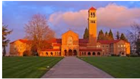
Explore and the grounds of Mount Angel Abbey on the solstice day!